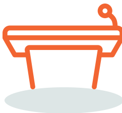
Exhibit to a Real Audience

After students complete the project, they will have the opportunity to air their podcast to the school's radio station or website. They will also have the option to post the podcast to their own social media platforms.