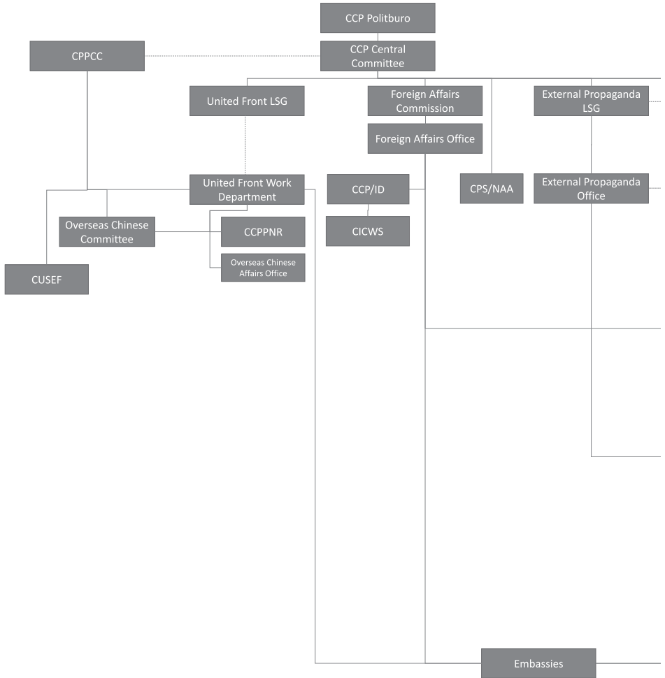
Figure 2 Chinese Influence Operations Bureaucracy

This is an uncorrected proof. Changes may occur before publication.