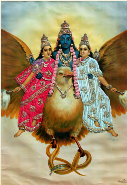
(Above) Vishnu-Garud Wahan, c. 1920, Paper, ink, fabric, metallic thread, Ravi Varma Press, Karlo-Lonavla

For further details, please visit AsiaSociety.org/Texas/events/upcoming